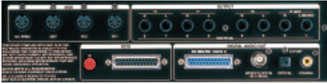
XV-5080 Rear Panel