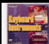
L-CDX-02 Keyboard Instruments