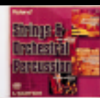
L-CDX-04 Strings & Orchestral Percussion