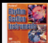
L-CDX-01 Rhythm Section Instruments