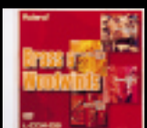
L-CDX-03 Brass & Woodwinds